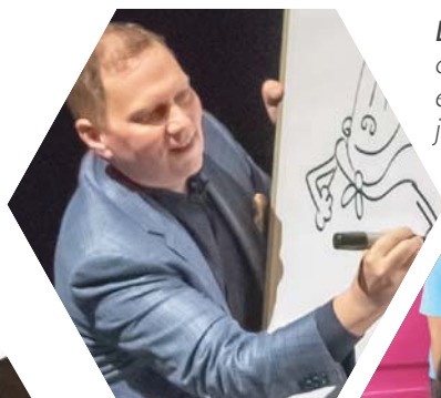
Left: Dav Pilkey event – his only Canadian public library event in 2018 – a sell out in just 20 minutes!

Milton Public Library worked closely with ROCK and the Positive Space Network in order to support Milton's LGBTQ+ youth community. MPL's Rainbow Collection provides youth with resources that provide important information as well as stories with relatable experiences. Programs including Rainbow Storytime, Pride Zine Workshop, and the monthly Prism Bookclub all of which highlight the library as a space where everyone is welcome.